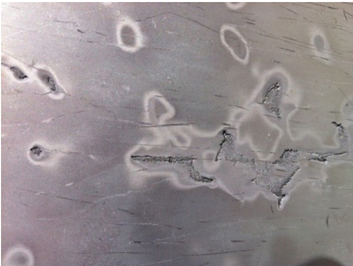
Example of cavitation erosion

The decades-long availability of ultrasonic cleaning has resulted in numerous studies that addressed technology benefits and areas of concern, where perhaps additional material degradation/damage testing is required.