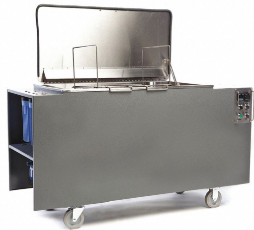
Grainger 50 gal. Ultrasonic Cleaner

The semiconductor industry led the way in development of PCB cleaning methodologies. While adopted by military, space and industries that had a need for similar processes, every sector tailored their cleaning protocols based on quantified contaminants, composition of electronic components and minimizing adverse effects.