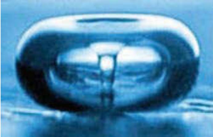
High speed flash photomicrograph of imploding cavity

precise agitation times, temperature, power and frequency. Considering all the features and available cleaning agent chemistries, operators have the ability to tailor the system to precisely fit the type of equipment being cleaned.